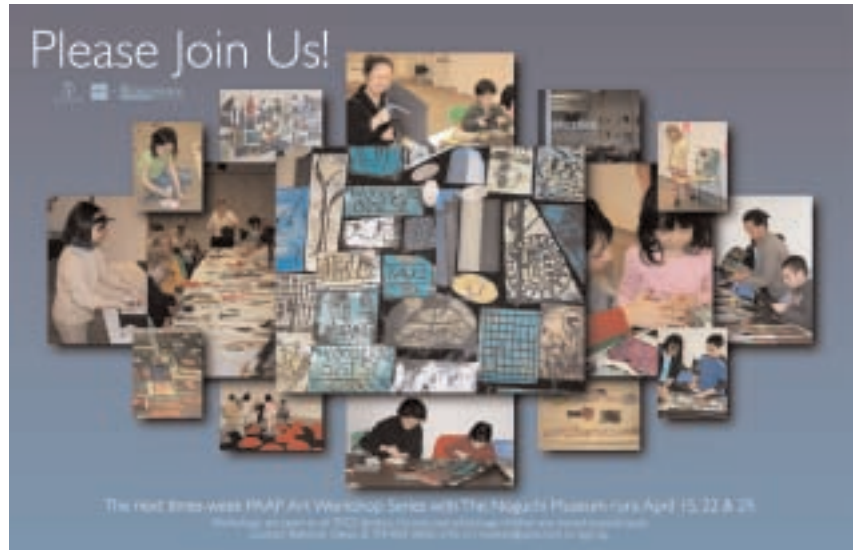
Last year’s poster, invited families to participate in the PAAP workshop series with The Noguchi Museum.

In addition we are mining the talents of our own staff. In the coming weeks students will begin signing up for after-school clubs to explore theater production, song-writing, painting, sculpture and animation, photography, music lessons and ensembles, poetry, journalism, poster-making and silk-screen techniques ... it’s going to be another eclectic and creative year here at Renaissance.